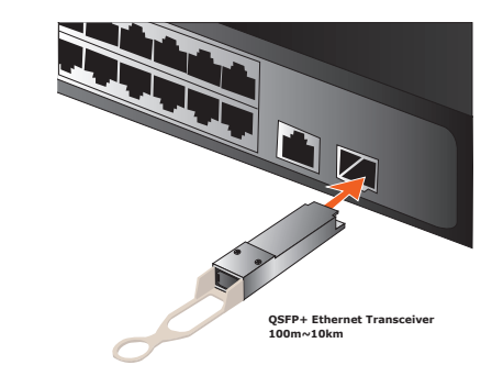
Figure 1: Insert the QSFP+ Ethernet Transceiver Module

Power on the Switch and place the Switch on a flat surface. Install the new QSFP+ Ethernet transceiver module by inserting it into the slot and sliding it in until it stops (See Figure 1). Press it firmly until you hear the module snap into place. Never force, twist or bend the QSFP+ Ethernet transceiver module. The QSFP+ Ethernet transceiver module slides in smoothly and the Switch will automatically detect the new module.